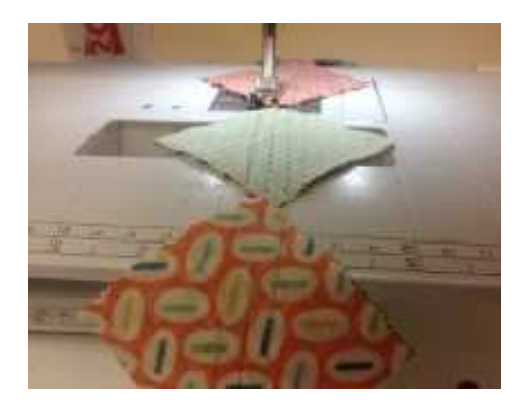
Cut the squares apart on the center line. Do not move the square yet.