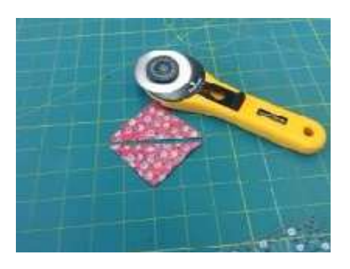
Using a ruler line up as shown and make the 2<sup>nd</sup> cut. This will give you 4 pairs. I know, they are really tiny so handle with care.