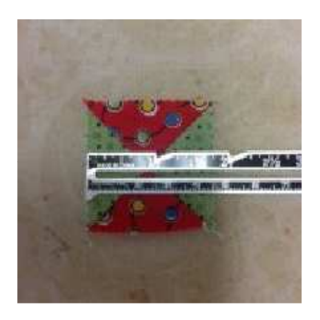
My squares measured 1 34"

The layout is 5 x 8 squares. Lay out is as pleases your eye, I was random. Sew the rows together.